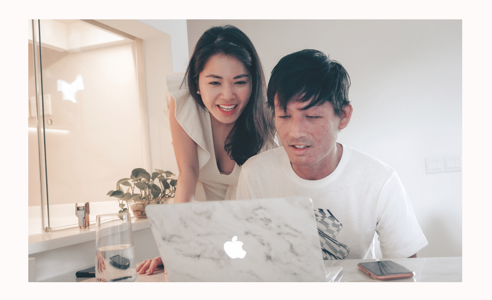
"There is a pressing need to talk about and normalise skin conditions."

That was when it struck her that there is a pressing need to talk about and normalise skin conditions, such as eczema, psoriasis, acne, rosacea, etc, to reduce the stigma surrounding them.